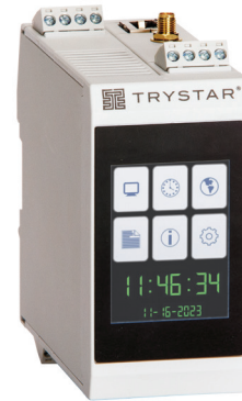
TIME SYNC HUB TSH-200 (shown)